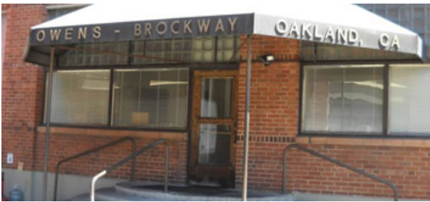
1.2 Million Square Feet - Roughly 1 Million Bottles a Day

Typical Risers Surrounding the Plant Monitoring Risers External Water Flow Tamper