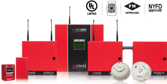
CWSI Headquarters - (954) 318-6005 10798 NW 53rd Street, Sunrise, FL 33351