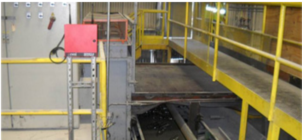
Roughly 35 Repeaters throughout the Facility All Repeaters will be in NEMA 4 Enclosure for Mechanical Protection