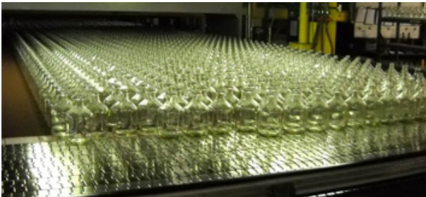
Building Divided by Two Extreme Temperatures High Temps of 100+ Degrees Ambient Temperature

Typical Risers Surrounding the Plant Monitoring Risers External Water Flow Tamper